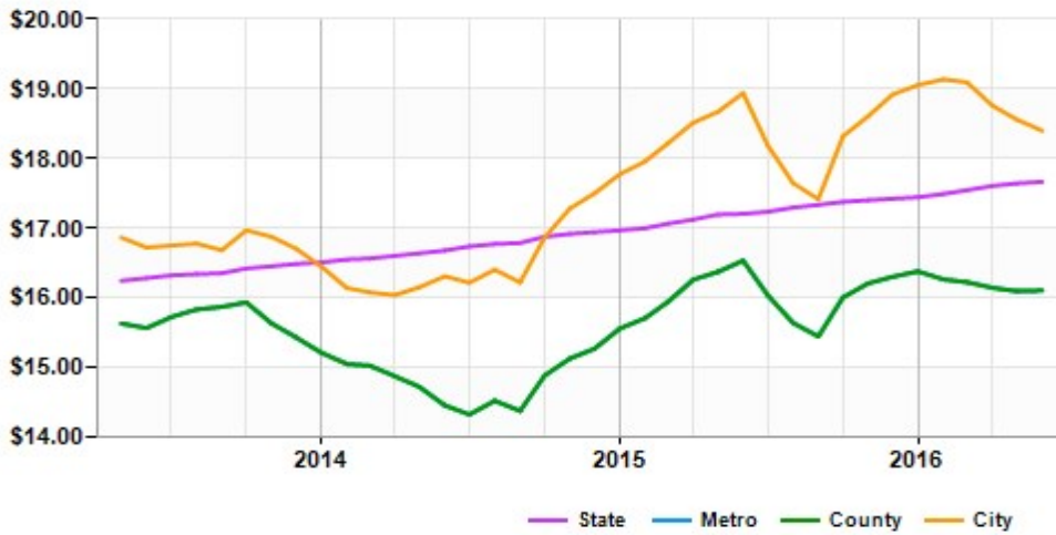
Asking Rent Office for Lease Brownsville, TX ($/SF/Year)